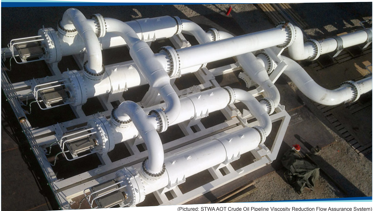
(Pictured: STWA AOT Crude Oil Pipeline Viscosity Reduction Flow Assurance System)

Design Control Drawings, Certifications, Specifications, Protocols and Procedures are available upon request by qualified customers.