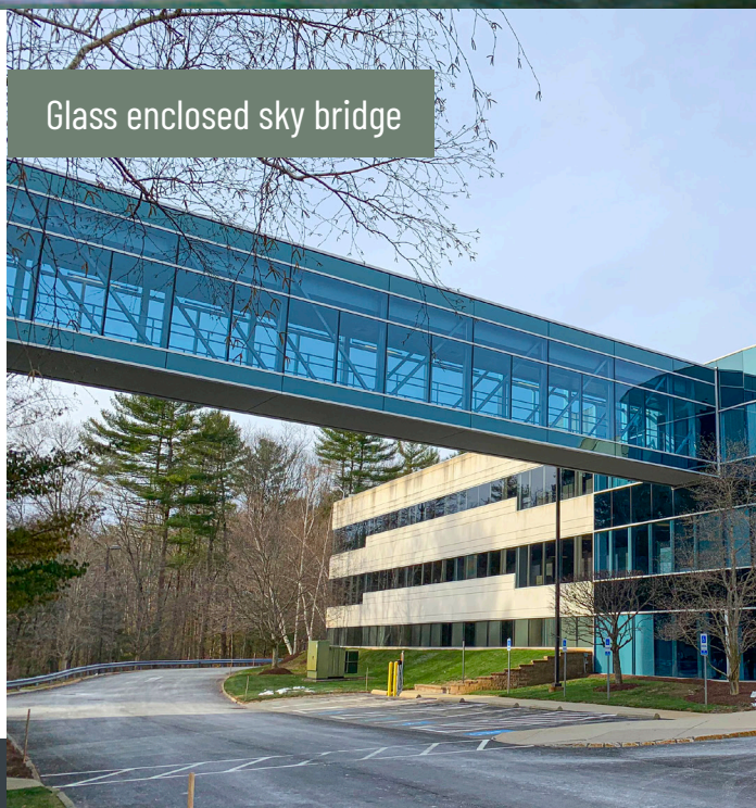
Glass enclosed sky bridge

Located immediately alongside Route 3 in Bedford, Massachusetts, just 15 miles northwest of Boston, it is conveniently located with access to almost all parts of eastern Massachusetts and southern New Hampshire. The property has easy access to Route 3, Route 128 and Route 495, providing direct access to all parts of the region.