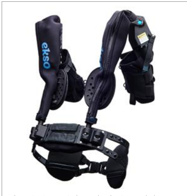
Ekso Bionics, an industry leader in exoskeleton technology, unveiled EVO, an endurance-boosting assistive upper body exoskeleton that alleviates the burden of repetitive work. Building on the Company's trailblazing EksoVest technology, EVO's innovative design is the next step in the evolution of industrial exoskeletons.

RICHMOND, Calif., Aug. 20, 2020 (GLOBE NEWSWIRE) -- Ekso Bionics Holdings, Inc. (Nasdaq: EKSO) (the "Company") , an industry leader in exoskeleton technology for medical and industrial use, today unveiled EVO™, an endurance-boosting assistive upper body exoskeleton that alleviates the burden of repetitive work. Building on the Company's trailblazing EksoVest technology, EVO's innovative design is the next step in the evolution of industrial exoskeletons.