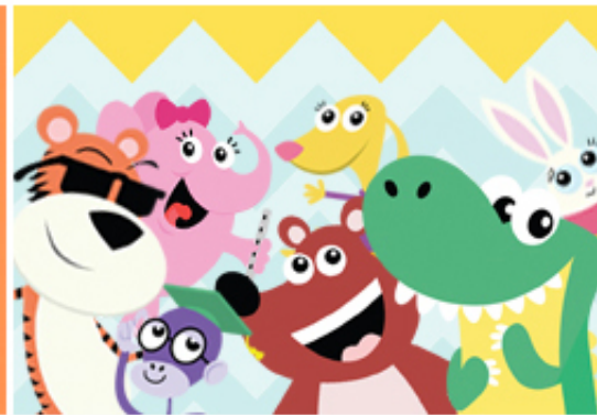
Characters from Baby Genius