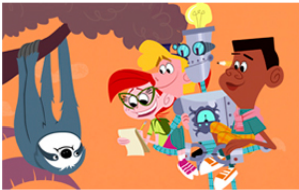
Thomas Edison's Secret Lab

Creation>Development>Production>Distribution>Retail.