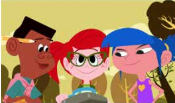
Characters from Thomas Edison's Secret Lab