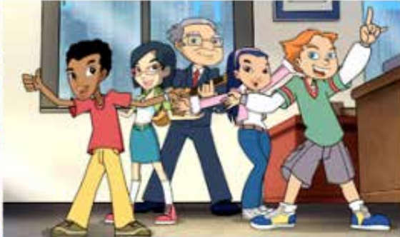
Characters from Warren Buffett's Secret Millionaires Club

This is the exact same model that gave rise to: