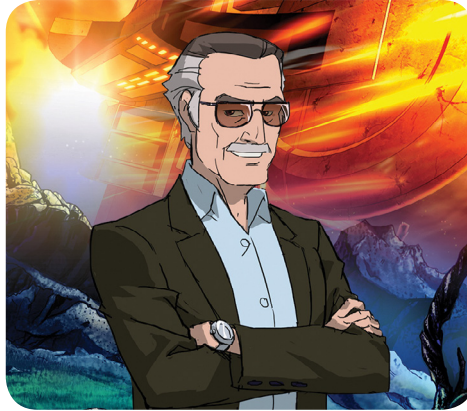
The Amazing Stan Lee

There are few people who can genuinely be called a legend, let alone a living legend. Stan Lee is one such person. As creator of Spider-Man , X-Men , Iron Man , The Incredible Hulk , Thor , The Avengers , and countless other characters, Stan Lee has given rise to billions of dollars of box office and many more times that in toys, games, electronics, publishing, and consumer products of all kinds. When he appears at the San Diego Comic-Con, it is like The Beatles arriving at Shea Stadium. He continues to do cameos in all his movies, guest stars in TV shows from Big Bang Theory to Entourage , and at 91 is as prolific and active as ever. Stan hosts his own TV show, and this last year started his own comic book convention, 'Stan Lee's Comikaze' at the LA Convention Center, which became an overnight success drawing tens of thousands of people. Stan sits in front of his keyboard every day and continues to generate new and fascinating superheroes, with comedy, pathos, drama, and imagination. He is glib, witty, articulate, and quick. He maintains offices both at Disney and in Beverly Hills.