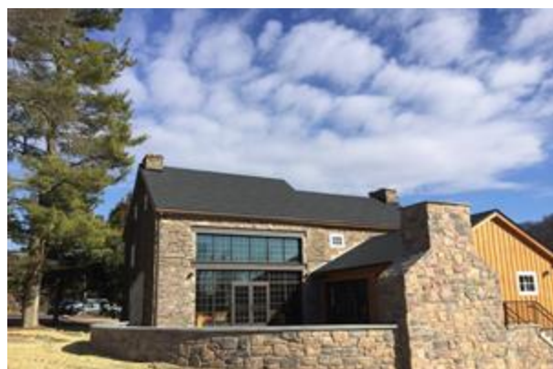
The IdeaFarm's exterior transformation

OAKS, Pa., March 27, 2017 (GLOBE NEWSWIRE) -- SEI (NASDAQ:SEIC) today announced the grand opening of the IdeaFarm, a centuries-old farmhouse renovated into an innovation space. Located on the campus of SEI's corporate headquarters in Oaks, PA, the historic building offers employees, clients, and partners a stimulating and interactive environment to foster and develop problem-solving skills and revolutionary thinking.