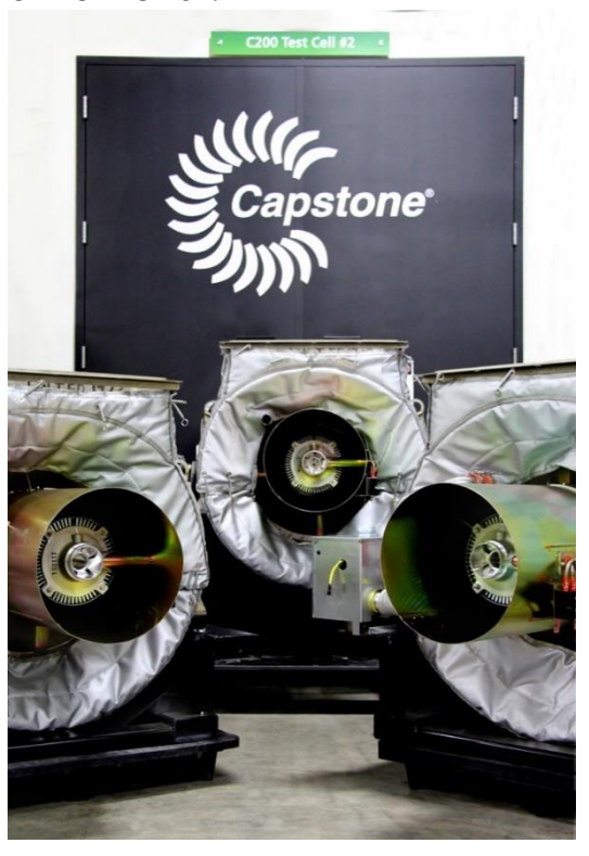
C200 Engines Ready for Installation

Suppliers that we'd been with for over 20 years suddenly wouldn't return our calls or emails, and when they did, they were raising prices as much as 5x. We wouldn't be sitting here right now having this conversation if our organization didn't respond the way it did. While many went onshore, we had to look offshore. We were able to make great new partners that met our cost, delivery and quality requirements even in this challenging environment. As a bonus, many of them agreed to help share the costs of the tariffs. A lot of the aforementioned cost reductions came out of these efforts. Now, those old suppliers are calling us back and asking about new business, but that's probably a conversation for our next chat.