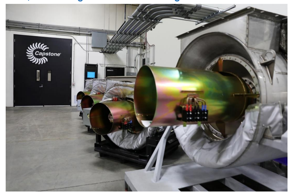
Capstone C200 Engine

This report focuses on Capstone Turbine Corporation (NASDAQ: CPST) and its goal of becoming a zero-waste facility, its changing operation model, cost-cutting and material challenges with tariffs.