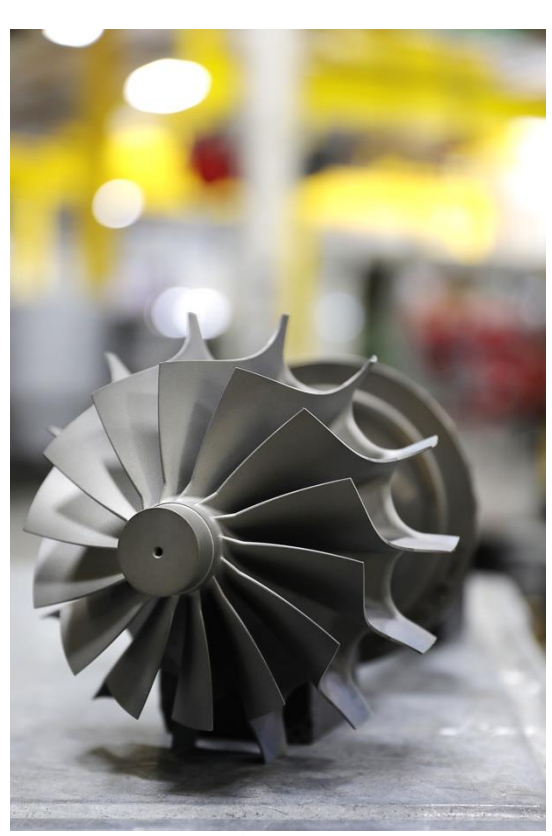
Capstone Turbine's C65 Rotor Group

That said, we're a very lean shop. Labor only makes up less than 25% of the total cost of our products, the rest being purchased materials. There are only about 40 people involved in the actual "build" of the product. All the work cells are set up in modules, and we focus heavily on efficiency, safety, quality and cross-training. This allows maximum flexibility in shifting labor needs.