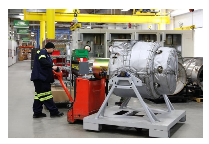
Lean Manufacturing and 5S: Core Elements of Capstone's Operational Model

Kirk Petty: Every single goal I've had relates back to two things: Cash and people. When I first came into this leadership team three years ago, I had a few goals in mind. The first was to minimize waste by consolidating our organization into a single facility. We did this in a four-month period without stopping production. The next goal was to make sure that we're building the product as economically as possible without sacrificing customer short term quality and long-term reliability. This involved ensuring we are procuring materials through the supply chain at the lowest cost and building the product in-house with the lowest added costs and the shortest lead-times.