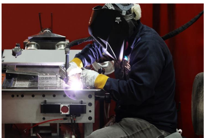
Precision and Repeatability Help to Ensure Quality at Capstone

reducing operating expenses. We also managed to do all of these things while keeping our team safe and promoting the family culture we've always strived for. The future goals are much of the same, continuing to address issues that cost the business money, all while keeping the team safe and motivated.