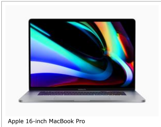
Apple 16-inch MacBook Pro

SANTA CLARA, Calif., June 15, 2020 (GLOBE NEWSWIRE) -- AMD (NASDAQ: AMD) today announced availability of the new AMD Radeon™ Pro 5600M mobile GPU for the 16-inch MacBook Pro . Designed to deliver desktop-class graphics performance in an efficient mobile form factor, this new GPU powers computationally heavy workloads, enabling pro users to maximize productivity while on-the-go.