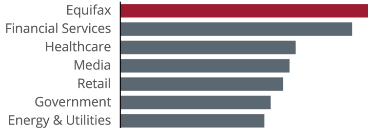
2020 Security Maturity Benchmark

The maturity of our security program exceeds every major industry average, as measured by a third party.