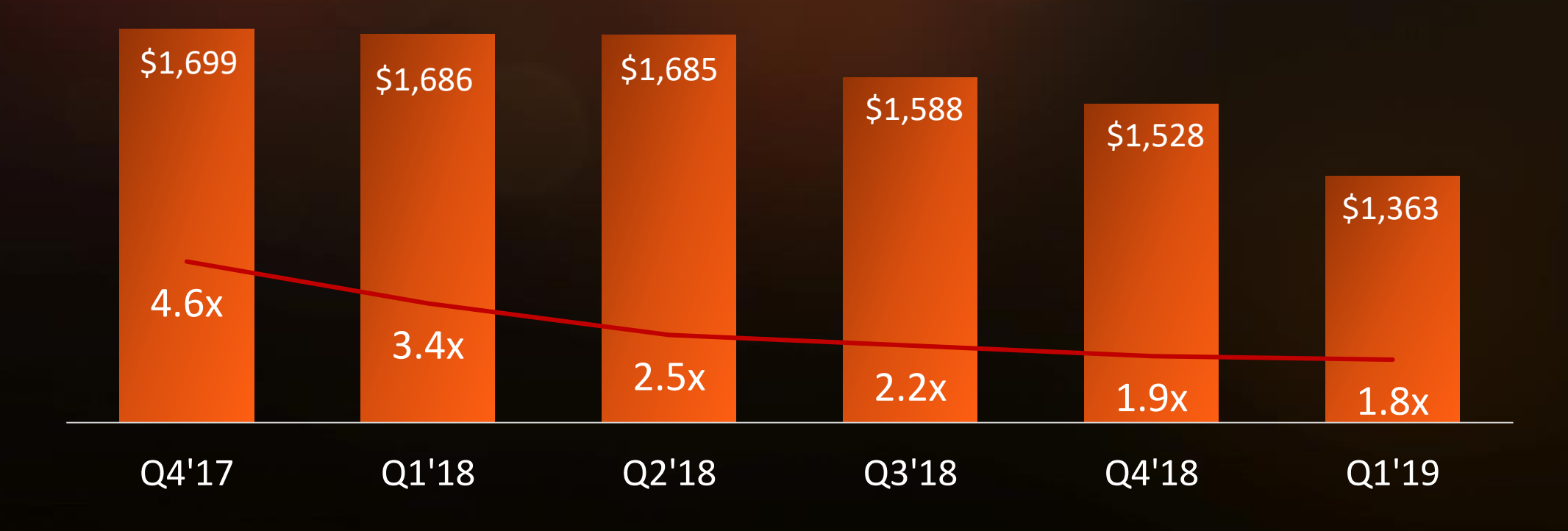
Focused debt reduction activities

(PRINCIPAL AMOUNT, $ IN MILLIONS, GROSS LEVERAGE TREND)(1,2)