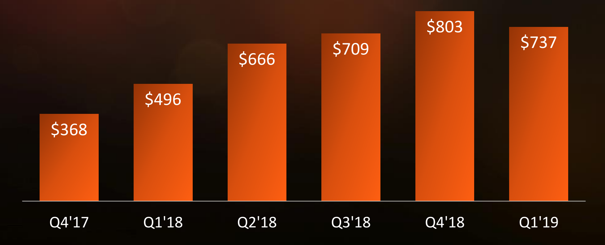
Solid business and financial execution

($ IN MILLIONS, CALCULATED AS TRAILING TWELVE MONTHS)(1)