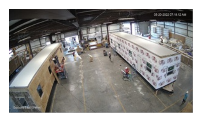
Safe & Green Holdings' Modular Manufacturing Facility