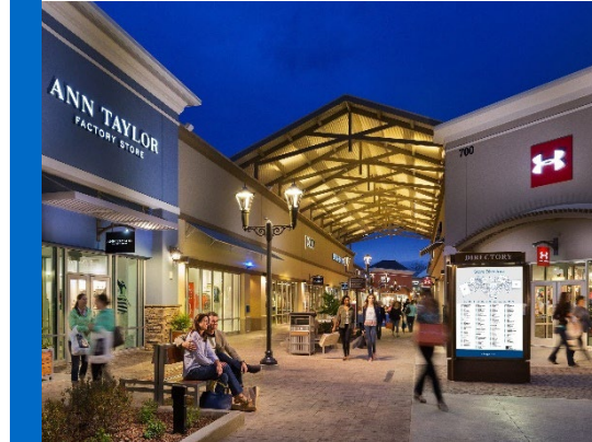
Tanger Asheville | Asheville, NC Acquired - November 2023