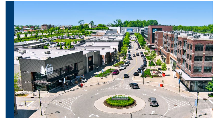
Pinecrest | Cleveland, OH Acquired - February 2025