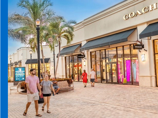
Tanger Palm Beach | Palm Beach, FL Strategic Partnership - July 2022