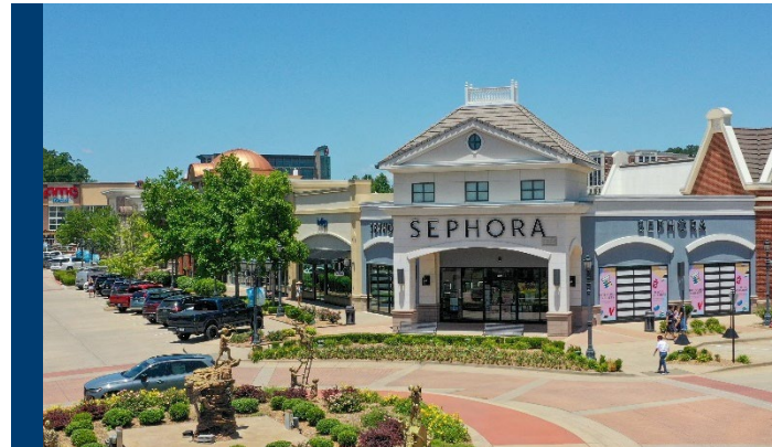
The Promenade at Chenal | Little Rock, AR Acquired - December 2024