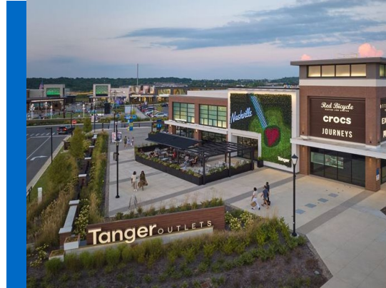
Tanger Nashville | Nashville, TN New Development - October 2023