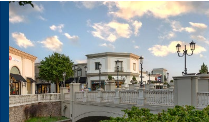
Bridge Street Town Centre | Huntsville, AL Acquired - November 2023