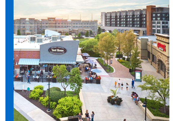
Tanger Kansas City | Kansas City, KS Acquired - September 2025