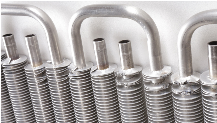
Steel micro cooling components for freezers.