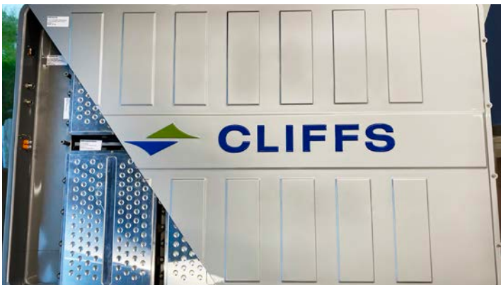
Cleveland-Cliffs EV Battery Enclosure on display at our Detroit, Michigan, office.

Below are examples of Cliffs' recent steel product solutions featured in our Sustainability Report 2023.