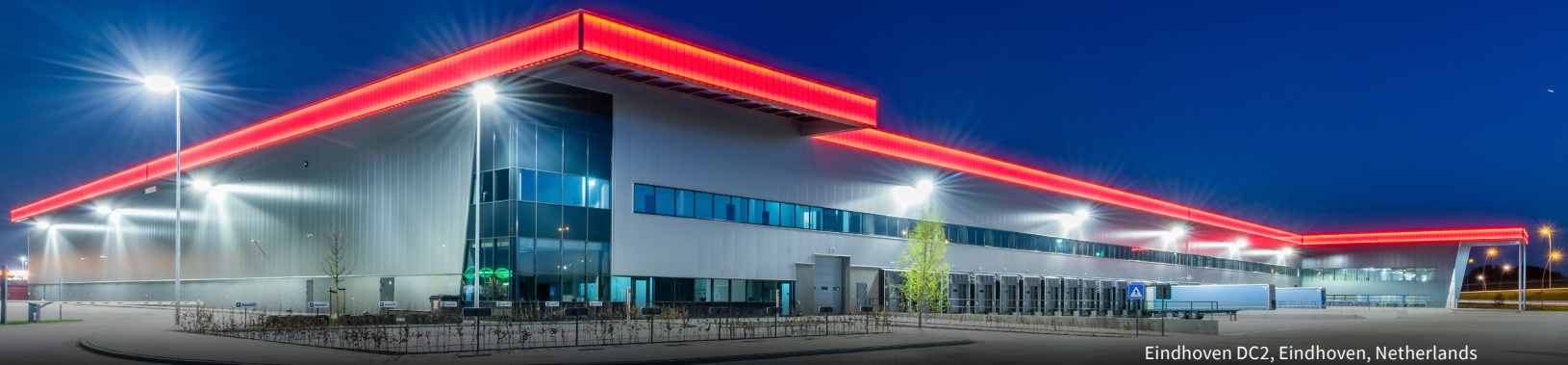
Eindhoven DC2, Eindhoven, Netherlands