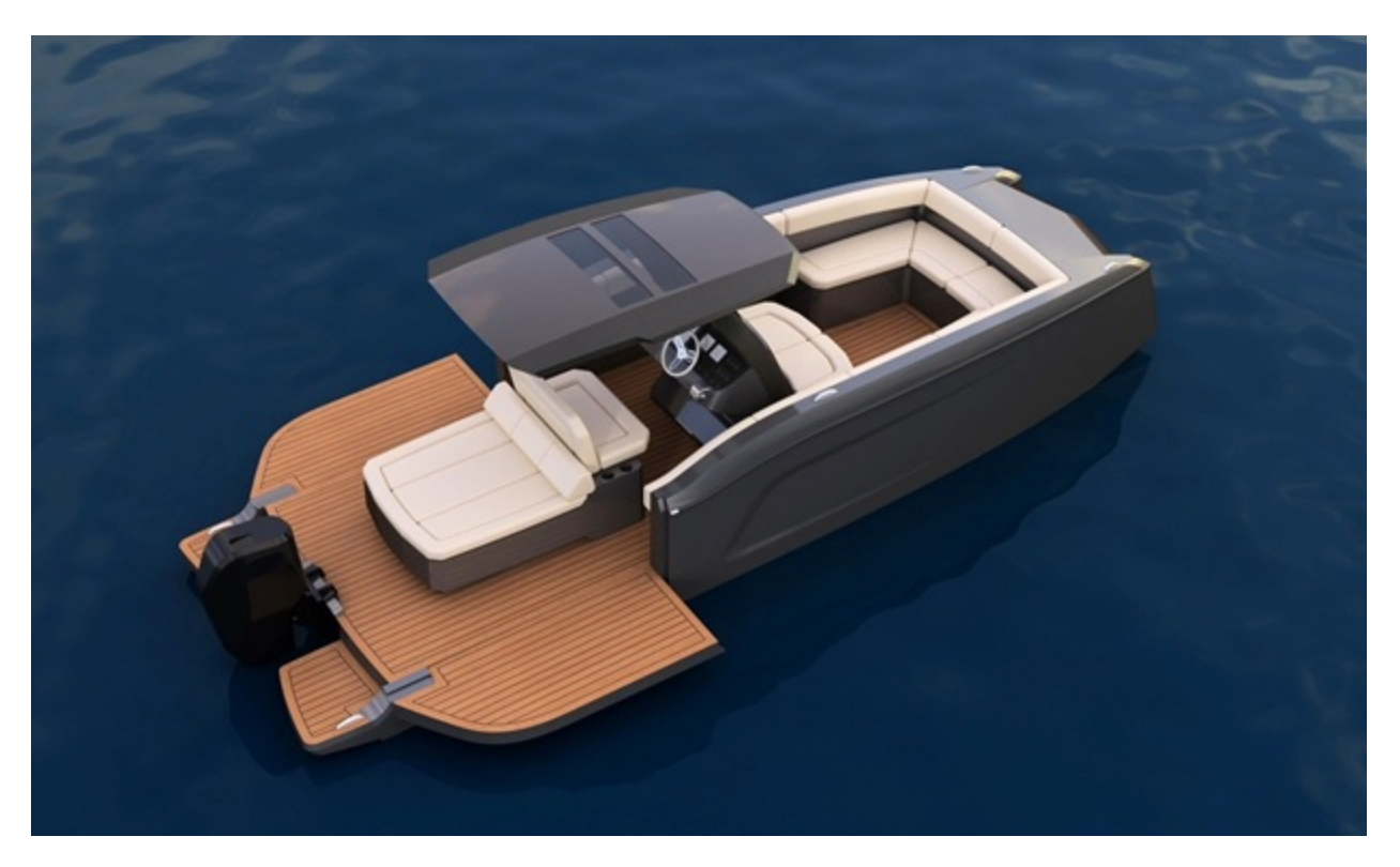
Rendered Image of FX1 from above with the doors open

intend to include various features in our FX1 model boat that will enhance an owners' time on the water," stated Visconti. "The team is considering everything from the user interface, navigation suites, system data, and multimedia options. When finally available for purchase, we believe that the FX1 will be an ultra-efficient, elegant, and environmentally-friendly boat that the entire family can enjoy."