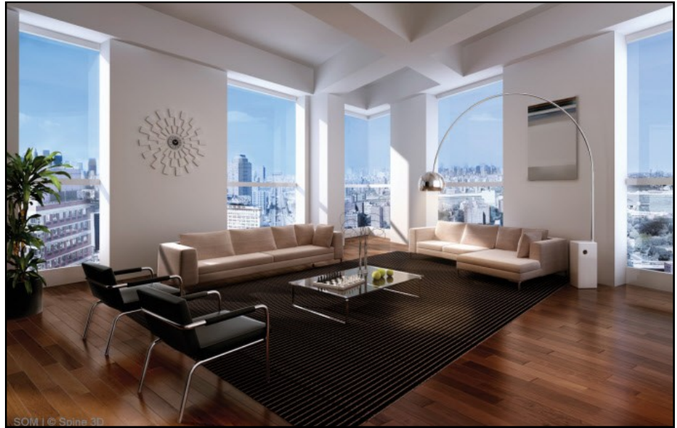
Toren's floor-to-ceiling views of the Manhattan skyline and New York Harbor

Toren's super-efficient, ultra-clean mechanical systems, designed by Energy Concepts Engineering, uses five Tecogen 100 kilowatt, InVerde™ cogeneration modules, located on-site, to fill much of the building's energy needs. At Toren, the cogen modules provide electricity for laptops and elevators and the waste heat they produce is used to heat interior spaces, provide domestic hot water, heat the pool and even run the air conditioning. Additionally, electricity typically travels over miles of wires from the power plant to our homes. Along the way, a significant amount of energy is lost to the wires. Toren's on-site system eliminates that inefficiency. In fact, the remarkably efficient Tecogen's cogeneration system reduces Toren's carbon footprint by more than 2000 tons of CO 2