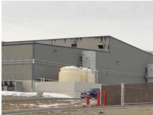
Flames inside the AquaRefining area reached the roofline.

MCCARRAN, Nev., Dec. 02, 2019 (GLOBE NEWSWIRE) -- Aqua Metals, Inc. (NASDAQ: AQMS) ("Aqua Metals" or the "Company"), which is reinventing lead recycling with its AquaRefining™ technology, today announced that on Friday evening, November 29, 2019, a fire occurred in the AquaRefining area of the plant. The fire took place in the evening and, fortunately, there were no injuries as the building was vacant at the time. Local fire authorities responded rapidly and extinguished the fire that evening.