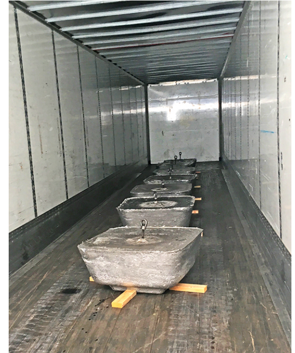
Shipment to JCI