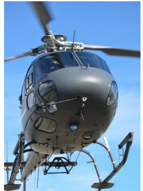
The Max-Viz 1400 (in white) installed on AS350 Écureuil.

Astronics' Max-Viz EVS provides improved safety through enhanced vision, enabling pilots to see more precisely in adverse weather conditions, such as haze, smoke, smog, and light fog, even on the darkest night. In addition, pilots can detect and avoid clouds for a smoother ride. While landing, pilots using the Max-Viz EVS can identify the runway and view the terrain clearly to avoid wildlife and unlit obstructions.