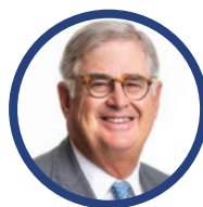
Samuel J. Palmisano Former Chairman of the Board, President & CEO, IBM