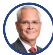
Darren W. Woods Chairman of the Board & CEO, Exxon Mobil Corporation