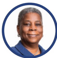
Ursula M. Burns Former Chairman of the Board & CEO, VEON, Ltd.