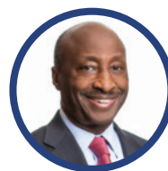
Kenneth C. Frazier Chairman of the Board & CEO, Merck & Co.