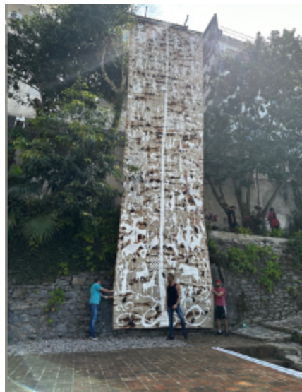
ARTIST: Walter Goldfarb TITLE: The Enchanted Tree DATE: 2023 MEDIUM: Tapestry of wool and mixed media SIZE: 12629 x 3450 SIDEMARK: ART-DK6-F22-ATR-29 LOCATION: Art at Deck 06 – 11 panoramic elevator wall