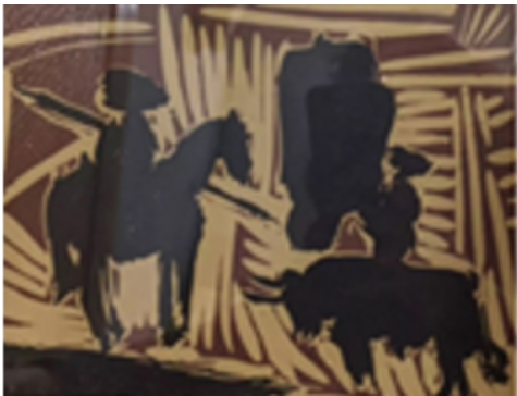
"Antes de picar al toro" Pablo Picasso

New Digital Art Tour to Enthrall Art Lovers