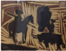
ARTIST: Picasso TITLE: Antes de correr el toro DATE: 1959 - 1961 MEDIUM: Lithout SIZE: 7 9/10 x 10 1/16 in SIDEMARK: ART-DK15-FZ4-PR7-03 B LOCATION: Art at Prime 07 free standing wall