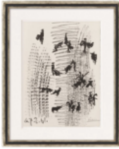
ARTIST: Picasso TITLE: Toros y Toreros DATE: 1961 MEDIUM: Lithograph SIZE: 14 9/16 x 10 4/16 in SIDEMARK: ART-DK15-FZ4-PR7-03 A LOCATION: Art at Prime 07 free standing wall