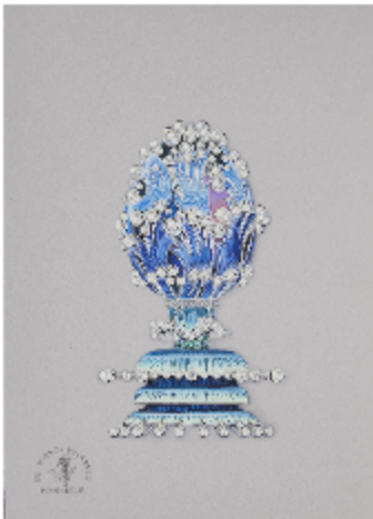
"Journey in Jewels"