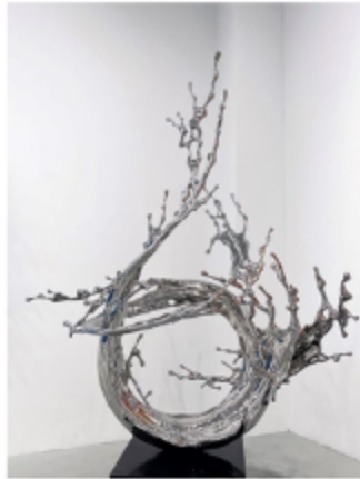
ARTIST: Zheng Lu TITLE: Water in Dripping - Waterfall DATE: 2021 MEDIUM: Stainless steel SIZE: 2050 x 7620 SIDEMARK: ART-CK5-FZ4-SPA-11 LOCATION: Art at Deck 06 Spa stairs

The ship itself is a work of art. In addition to a number of notable design touchpoints, Seven Seas Grandeur , the sister ship to the acclaimed Seven Seas Explorer ® and Seven Seas Splendor ®, will exemplify Regent's 30-year heritage of perfection with unrivaled space, unparalleled service, and transformative experiences that will begin the moment guests step on board.