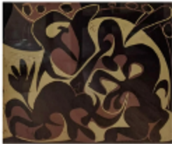
ARTIST: Picasso TITLE: Paseo por el toro, con matador al quite DATE: 1959 - 1961 MEDIUM: Lithout SIZE: 15 x 15 7/10 SIDEMARK: ART-DK15-FZ4-PR7-03 C LOCATION: Art at Prime 07 free standing wall