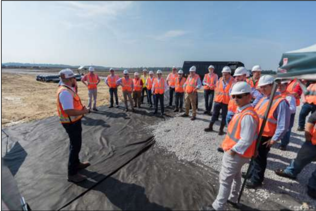
+30 Attendees at the Poplar Grove Mine Site Visit