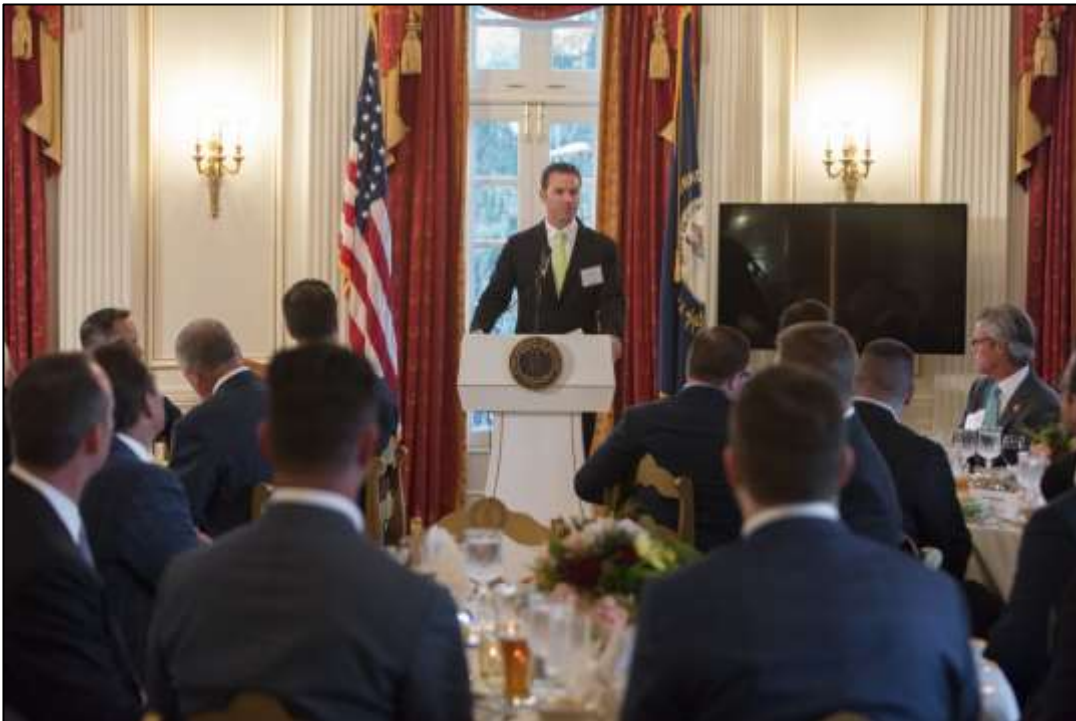
Paringa's Dinner Evening at the Governor's Mansion