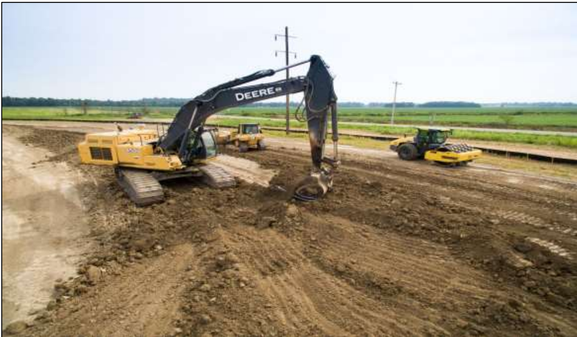
Site Preparation Activities at Poplar Grove Mine