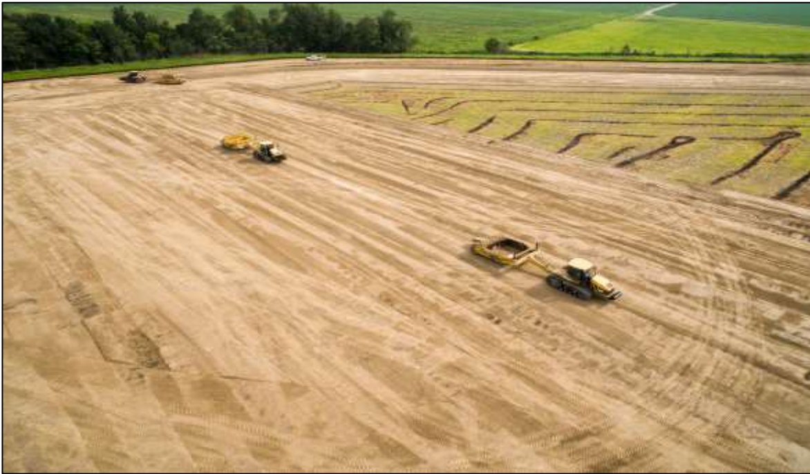
Site Preparation Activities at Poplar Grove Mine