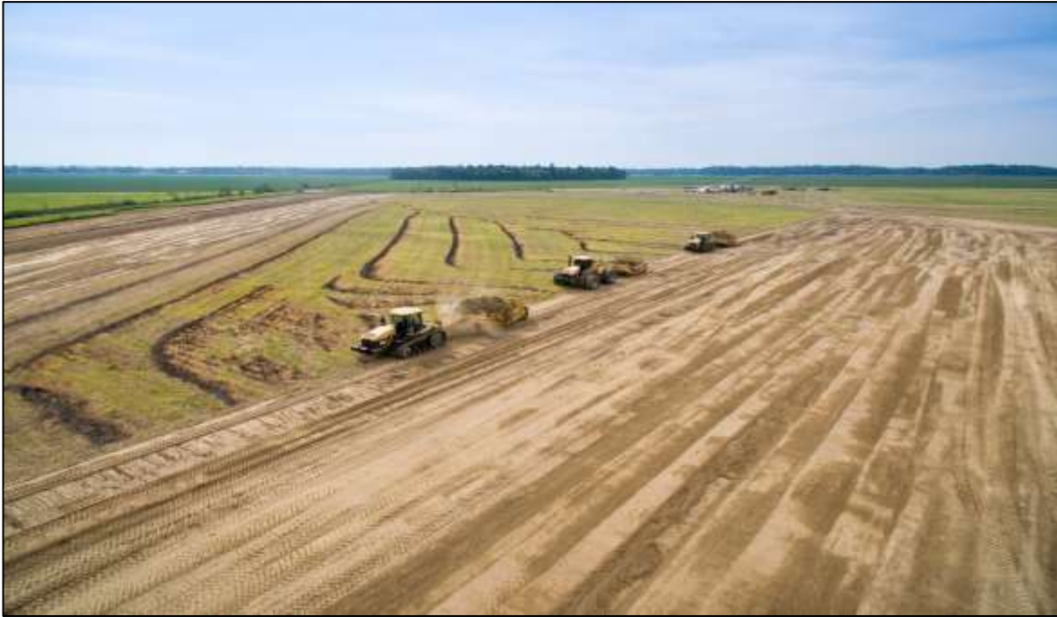
Site Preparation Activities at Poplar Grove Mine