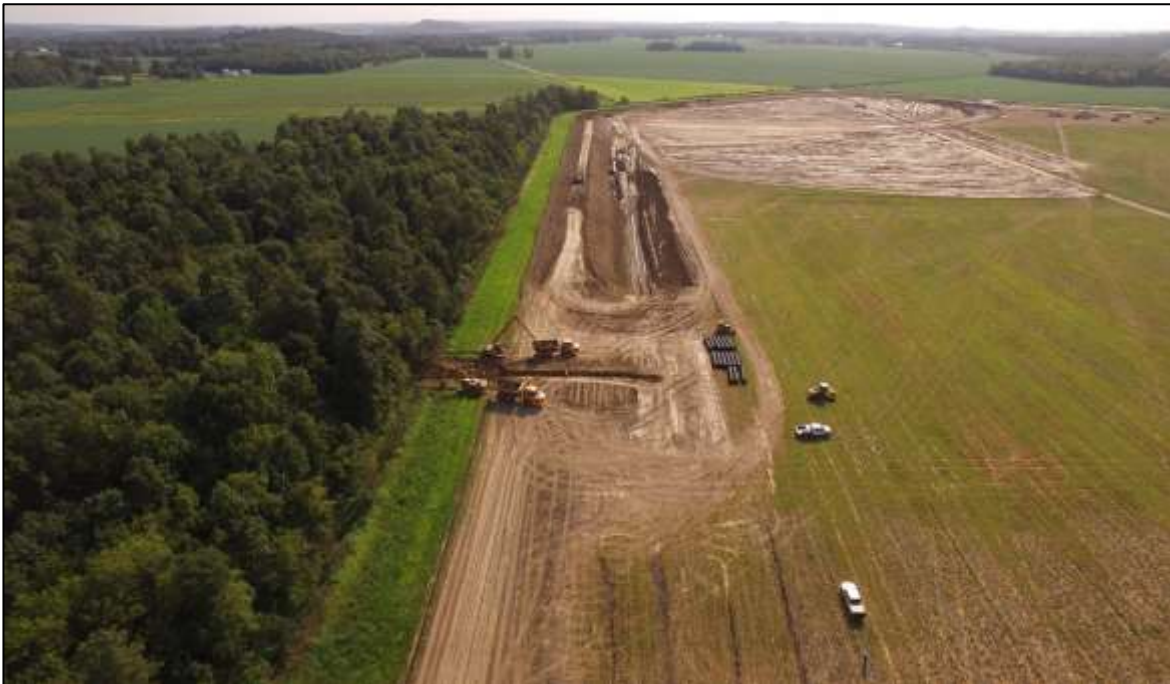
Construction of Levies Surrounding the Poplar Grove Mine

Paringa Resources Limited (“ Paringa ” or “ Company ”) is pleased to provide an update of the construction of the Poplar Grove mine (“ Poplar Grove Mine ”). Paringa looks forward to providing regular updates of the construction of the Poplar Grove Mine with photos and videos uploaded regularly to the Paringa website: www.paringaresources.com .