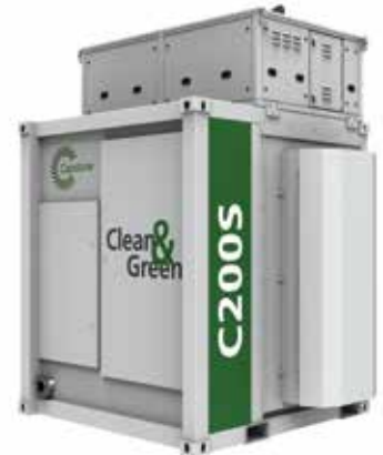
C200S ICHP Microturbine