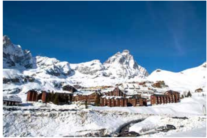
A dual mode Capstone C1000S microturbine operates in a CHP application in Italy for a district heating plant in Breuil.

In April 2018, Energetica S.p.A. commissioned a Capstone microturbine to provide a reliable solution for generating electricity and steam for the Breuil-Cervinia district heating plant. Babuin points out the IBT and Energetica project partnership developed because of IBT's ability to provide a unique solution that utilized a Capstone microturbine instead of a classic piston engine. "Mountain communities unfortunately cannot yet rely on a stable electricity supply from the grid. For this reason, a dual mode C1000S standalone system was selected," says Babuin. The C1000S dual mode high pressure natural gas enables continuity of electrical energy and heat service for the area's population in the event of a temporary malfunction of the national grid. IBT was able to install the solution at 2,000 meters above sea level. "Having very few scheduled maintenances is important during winter time because the site is difficult to access because of snow," says Babuin. Very low atmospheric emissions are another benefit. The thermal demand for superheated water at 105°C (221°F) can be produced with specially-designed heat recovery modules. At the boiler output, the fumes are subsequently introduced into the atmosphere while the hot water is fed into the distribution network to the connected users.