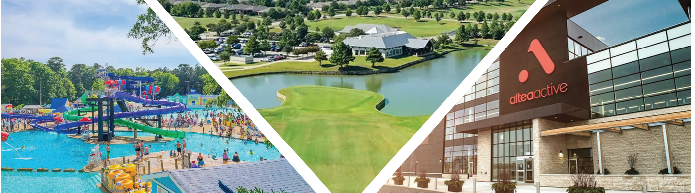
OCEAN BREEZE WATER PARK - Virginia Beach, Virginia