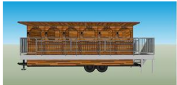
Rendering of 12-unit Hostel Cubed prototype