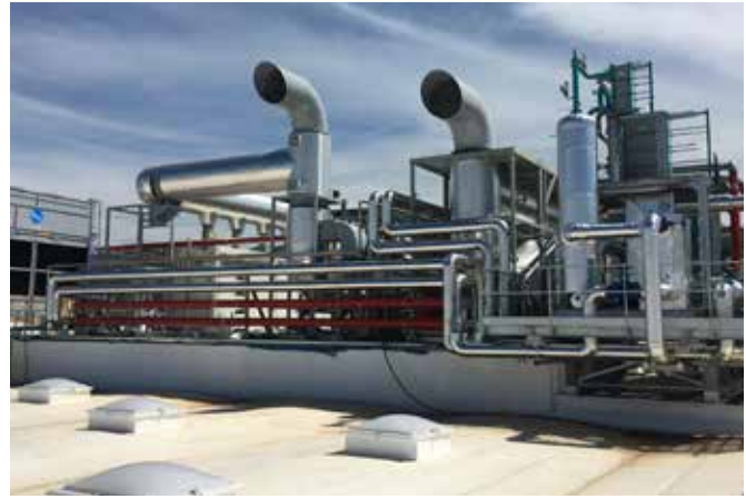
A high-pressure natural gas-fueled Capstone C1000S microturbine in a CCHP application provides 80% overall efficiency at the Salumificio Fratelli Coati facility.

600 kW. Before being released, the exhaust is further cooled in a hot-water-heat exchanger that is used to heat the facility's water to about 70°C (158°F).