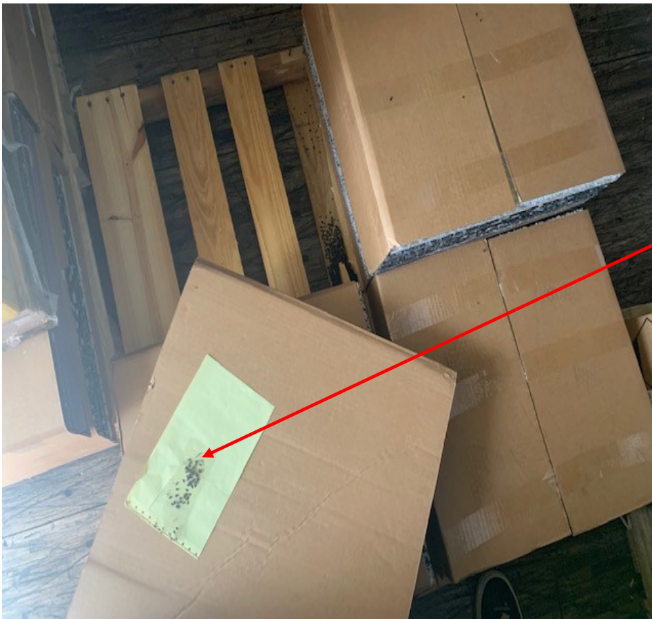
Example: Rodent droppings on cardboard