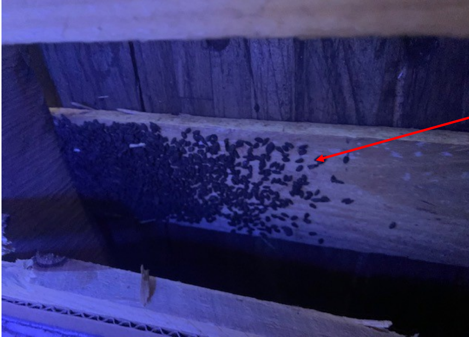
Example: Rodent droppings on a pallet