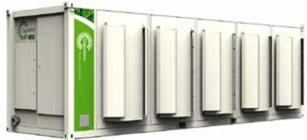
A C1000R Microturbine provides up to 1 MW of electrical power and contains 5 microturbine engines.