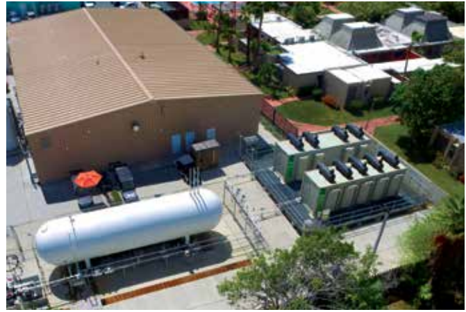
The on-site power plant at Margaritaville Vacation Club by Wyndham Resorts includes a 35,000-gallon propane storage tank that provides enough fuel to sustain on-site power generation for 14 consecutive days.

financial peace of mind to microturbine customers by providing product life cycle costs at a fixed rate for both scheduled and unscheduled maintenance.