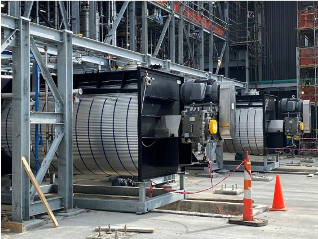
Figure 4: Installation of Extruder in Building 610