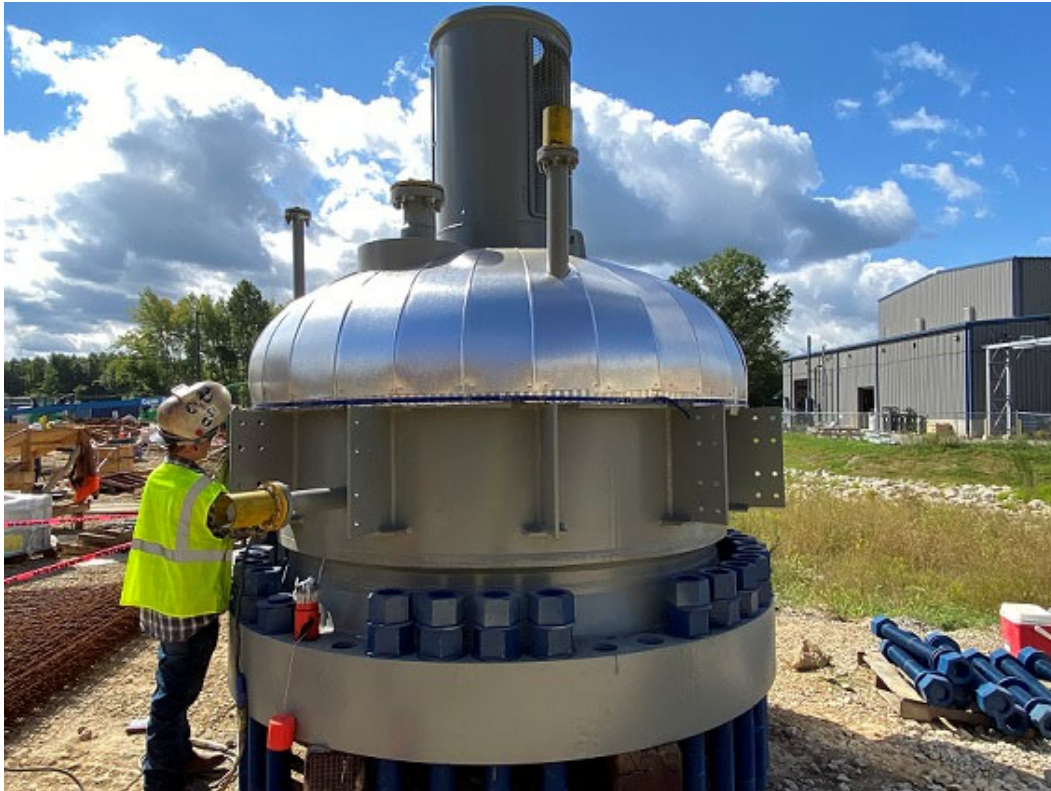
Figure 6: Installation of WWPT Tank