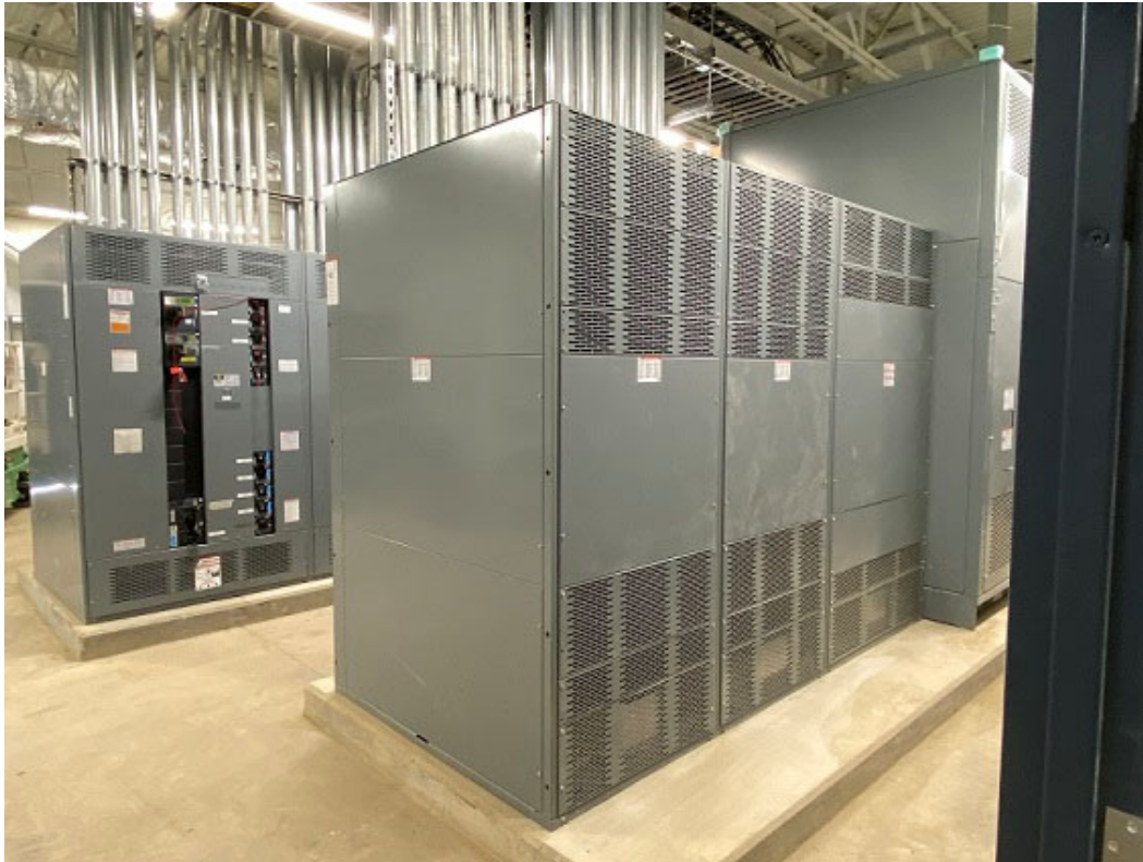
Figure 2: Completion of Piping Installation in Building 509