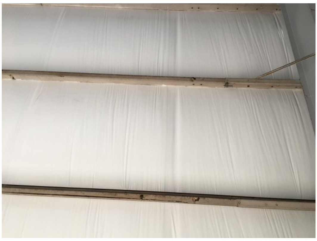
Figure 3: Building 504 Roof Insulation Installation