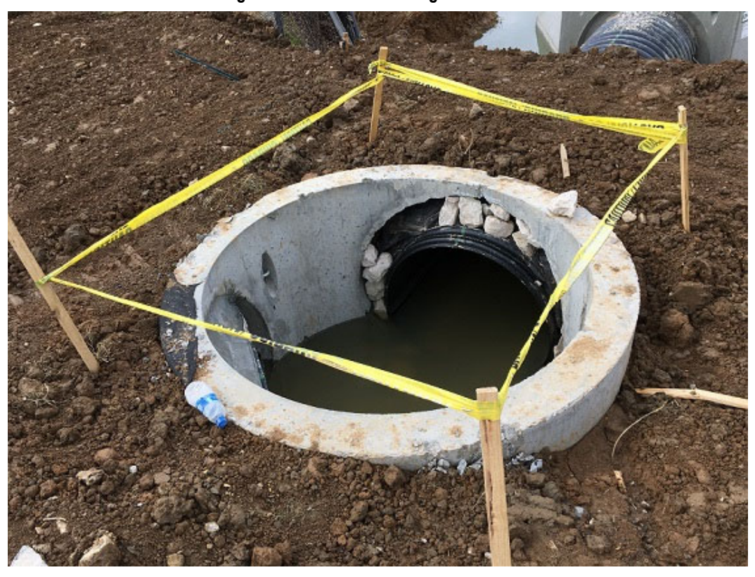
Figure 5: Stormwater Drainage Installation