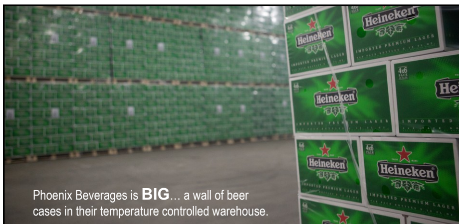
Phoenix Beverages is BIG ... a wall of beer cases in their temperature controlled warehouse.

The beer distributor was grateful for another benefit of grid independence in the Fall of 2011 when Hurricane Sandy left much of the Greater New York City area in the dark for a week or longer. Phoenix Beverages was able to remain operational and was delivering to their customers one day after the storm.