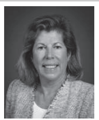
Director since: 2012 Age: 61 Board Committees: Audit, Risk Oversight