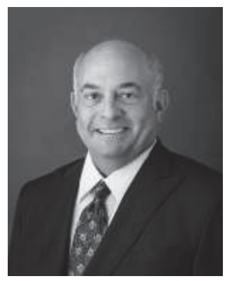
Director since: 2009 Age: 58