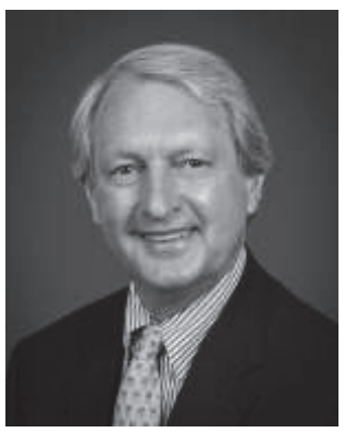
Director since: 2009 Age: 68 Board Committees: Audit, Compensation, Risk Oversight