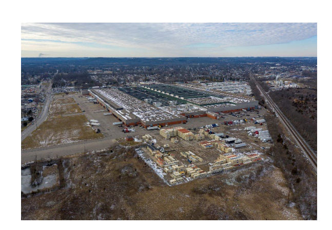
UPREITs and 721 Tax-Efficient Exchanges 2023