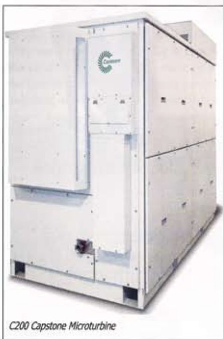
C200 Capstone Microturbine