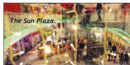
The Sun Plaza.

"We are convinced that a microturbine is the best economical decision for a large