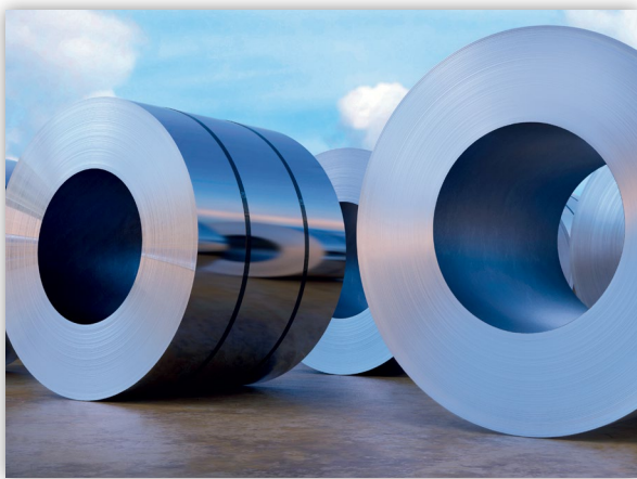
DURANAR® is a registered trademark of PPG Industries

Aluminum coated Types 409 and 439 were developed to provide the automotive industry with longer-life exhaust system materials. Type 1 hot-dipped aluminum coating provides excellent resistance to muffler condensate corrosion and pitting from road salt, which allows the exhaust system to remain virtually rust free, thus retaining its good appearance.