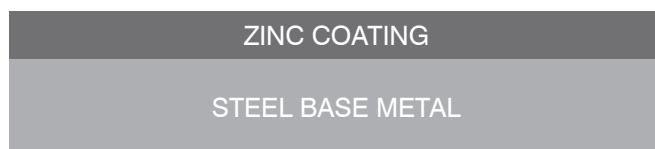
FIGURE 2 – COATING CROSS SECTION