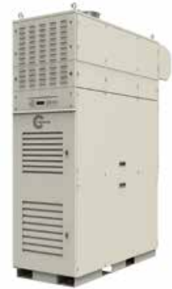
C65 CARB Microturbine