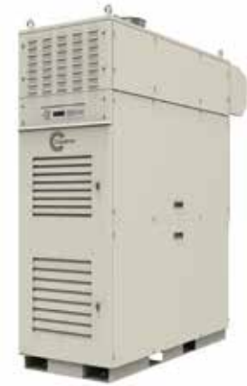
C65 ICHP Microturbine