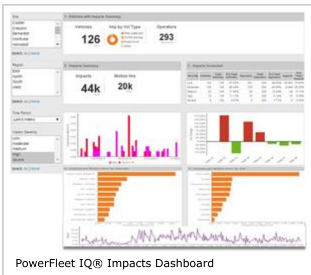
PowerFleet IQ® Impacts Dashboard

Since its commercial release in January 2016, PowerFleet IQ has been implemented at hundreds of Fortune 100 sites across dozens of customers representing manufacturing, distribution, warehousing, and aviation customers. The knowledge gained in these implementations combined with customer feedback, has been incorporated into PowerFleet IQ 2.0, bringing together a simpler and easier to use interface with improved visualizations to help customers make critical decisions to improve operational efficiency, damage avoidance, safety, and compliance. With streamlined report navigation and enhanced drill through capabilities, users can more readily turn insights into actionable opportunities and drive more