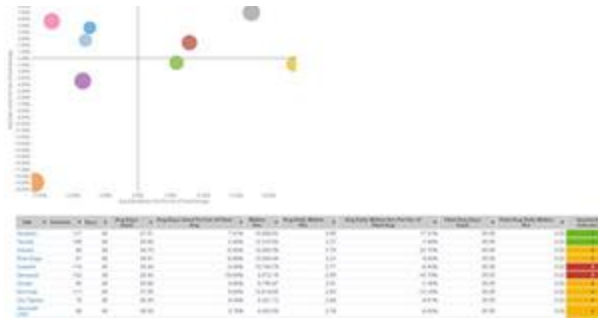
PowerFleet IQ® Vehicle Productivity by Site Dashboard