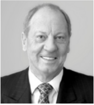
E. NEVILLE ISDELL

Mr. Diller is Chairman of the Board and Chief Executive Officer of IAC/InterActiveCorp, an interactive commerce company. He is also Chairman of the Board and Senior Executive of Expedia, Inc., an online travel company. He has held his position with IAC or its predecessors since August 1995. He was Chairman of the Board and Chief Executive Officer of QVC, Inc. from December 1992 through December 1994. From 1984 to 1992, Mr. Diller served as the Chairman of the Board and Chief Executive Officer of Fox, Inc. Prior to joining Fox, Inc., Mr. Diller served for ten years as Chairman of the Board and Chief Executive Officer of Paramount Pictures Corporation. He is a Director of The Washington Post Company.