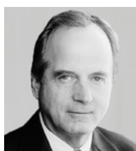
PETER V. UEBERROTH

Mr. Robinson is General Partner of RRE Ventures, a private information technology-focused venture capital firm, and has held this position since 1994. He is also President of JD Robinson, Inc., a strategic advisory firm and the nonexecutive Chairman of the Board of Bristol-Myers Squibb Company. He previously served as Chairman and Chief Executive Officer of American Express Company from 1977 to 1993. Mr. Robinson is also a Director of First Data Corporation and Novell, Inc.