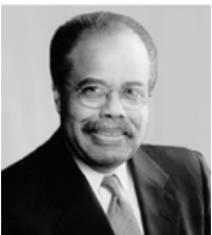
DONALD F. McHENRY