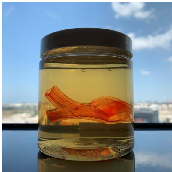
3D bioprinted trachea using CollPlant's BioInk.

First, our R&D team continued moving forward aggressively across all our major programs. We are developing formulations comprised of rhCollagen and hyaluronic acid for dermal filler products used in the medical aesthetics market. In parallel, CollPlant is also advancing our collaboration with a leading company in this field. Within 3D bioprinting, we are developing rhCollagen-based BioInks for 3D printed lung scaffolds in collaboration with United Therapeutics. We are also advancing collaborations with other companies to develop 3D bioprinted tissues and scaffolds for regenerative medicine applications. Furthermore, our proprietary rhCollagen-based regenerative breast implants program has accelerated, and we are planning to launch an animal study in Q1 2020.