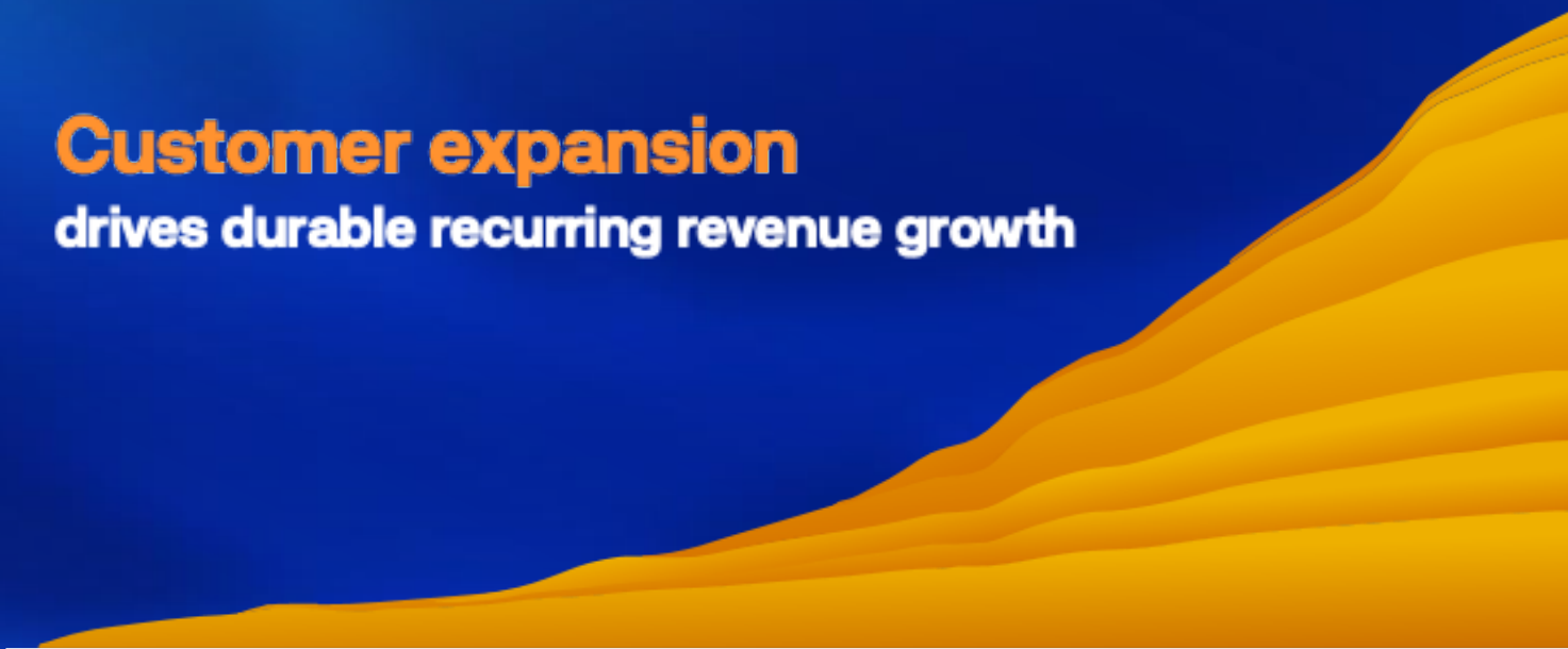
Monthly Recurring Revenue

Customer expansion drives durable recurring revenue growth