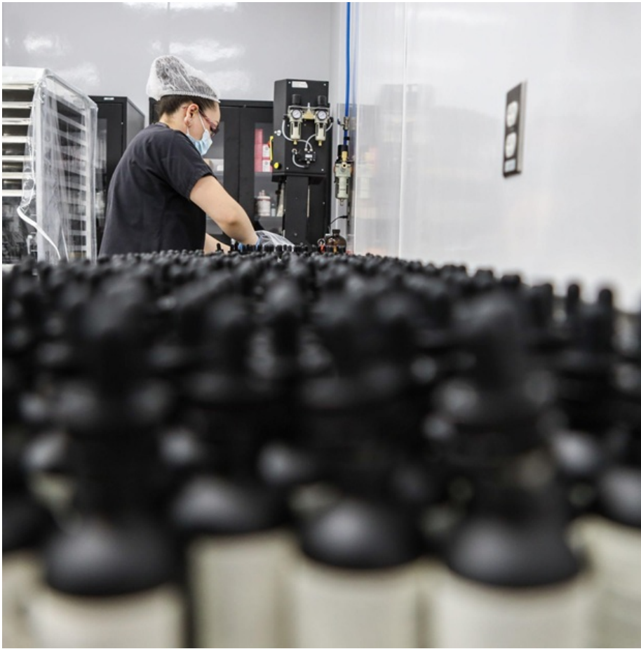
City Trees production of Nevada's best selling tincture products