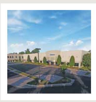
11650 Lakeside Crossing Court 100,021 square feet St. Louis, MO