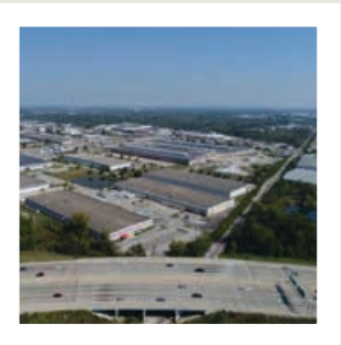
Shadeland Commerce Center 1,747,411 square feet Indianapolis, IN