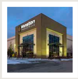
30339 Diamond Parkway 404,184 square feet Cleveland, OH