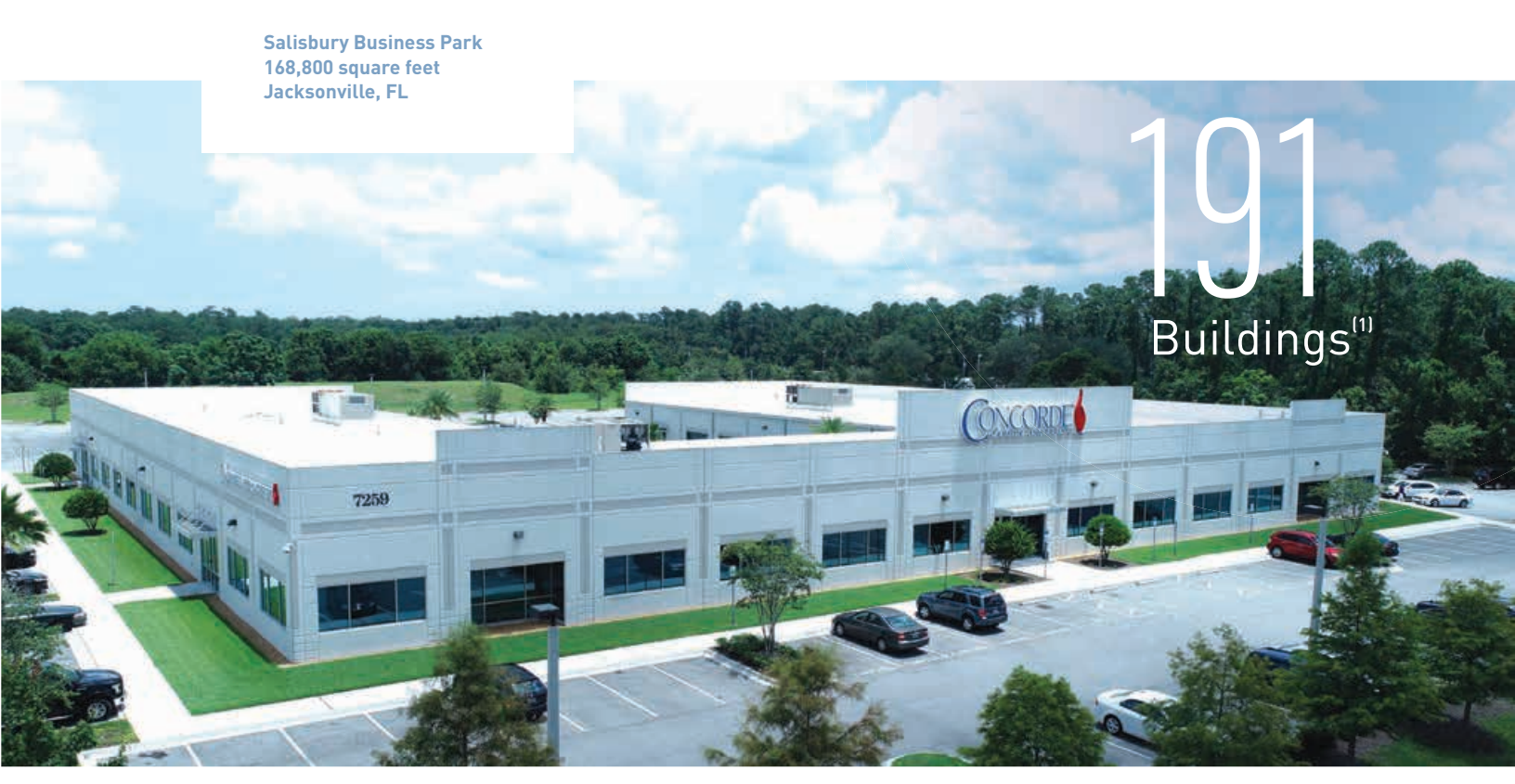
(1) Wholly owned and joint venture as of December 31, 2021