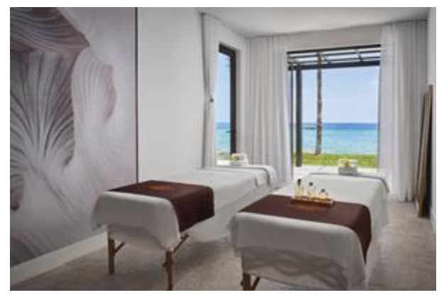
Silver Cove at Great Stirrup Cay

Norwegian Cruise Line Holdings' private island in the Bahamas