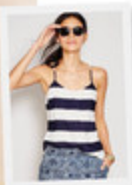
Striped Tank Top / Nautical Pattern Skirt

"I'm constantly crunched for time and appreciate a simple striped tee that can really anchor (no pun intended) a look."