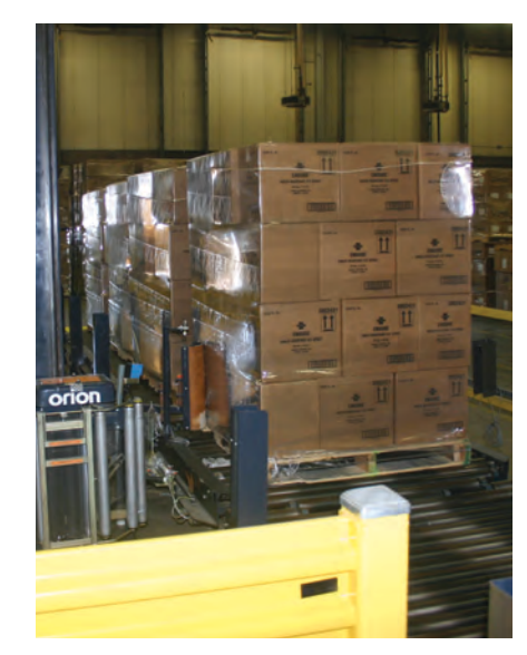
The entire organization is moving towards becoming a metric-driven operation utilizing standardized processes & procedures.