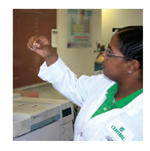
Activities from our transformation are intended to improve cycle times, increase reliability, and eliminate waste.

In fiscal 2013 and beyond, we will be focused on consistently meeting our customers' needs while driving stronger, more sustainable operational and financial performance. While we still have a lot more work to do, we are a different company than we were a year ago. With our strong brands, we expect to achieve more consistent revenue growth, more reliably predictable operating margins and significantly improved profitability. Ultimately, our long-term goal for Central is to consistently achieve 10%