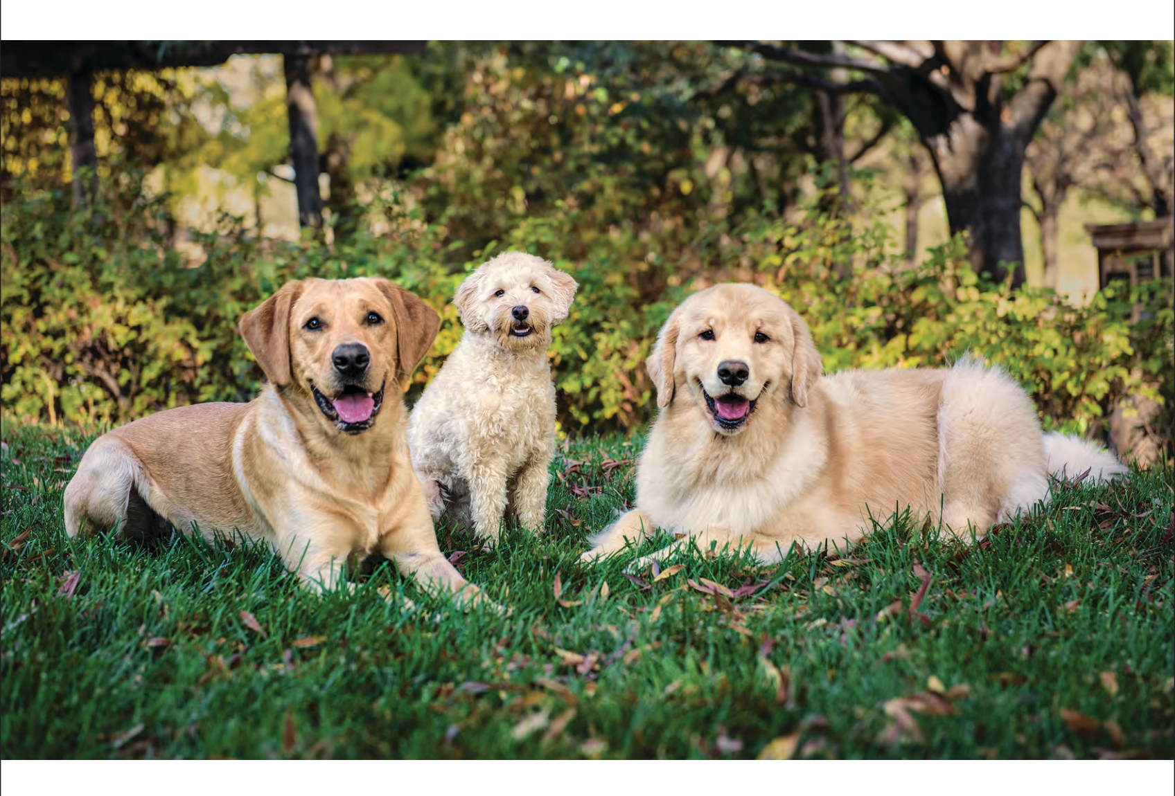
2012 ANNUAL REPORT