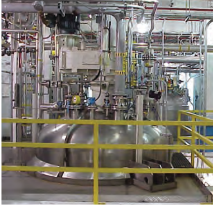
The company's transformation undertaken this year is intended to develop centers of excellence and consolidate underutilized facilities.

transformation efforts. We expect savings from our cost-cutting initiatives to bring better profitability in the years ahead.