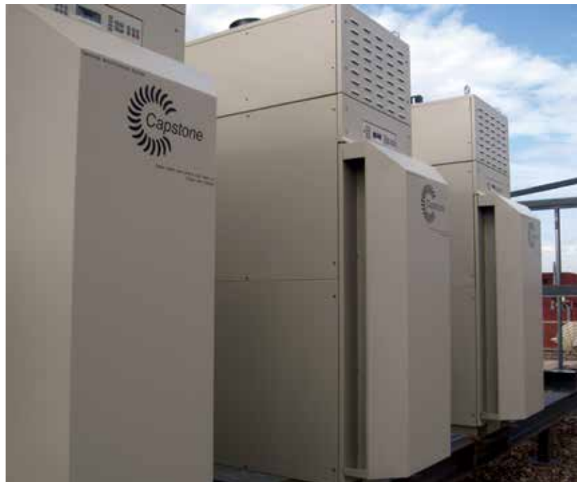
Three natural gas C65 ICHP Capstone microturbines provide electrical and thermal power at the Four Seasons Hotel Philadelphia.

“Reciprocating engines have to be rebuilt at 22,000–23,000 hours, have oil replaced regularly, consist of lots of moving parts, and have high vibration and noise. We can’t have noise at a hotel – that would be a disaster,” Dixon added.